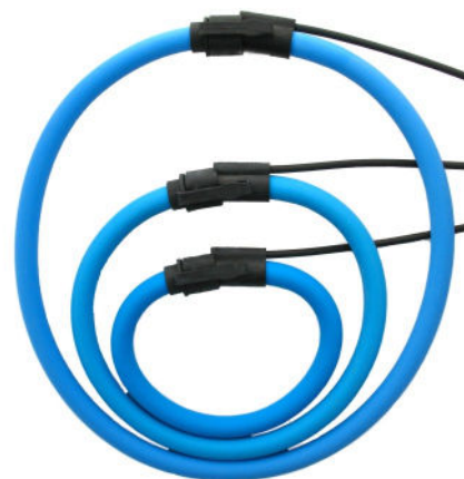
DENT's RoCoil Current Transformers. 16", 24", and 36" lengths pictured.

Visit the DENT website or contact us for further information.