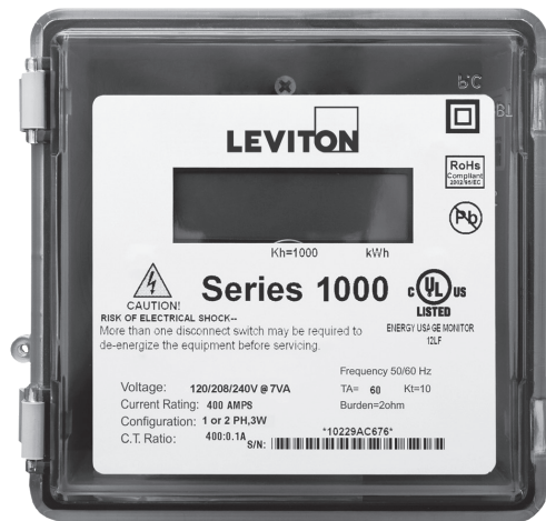
Outdoor NEMA 4X Enclosure