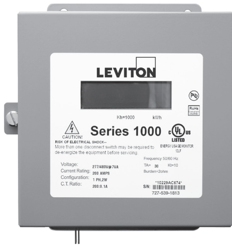
Indoor JIC Steel Enclosure